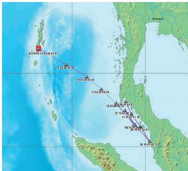
Tracking: SV IRON LADY, KD7SVU, is showing her current position on the internet, with data-based former positions also being visualized.