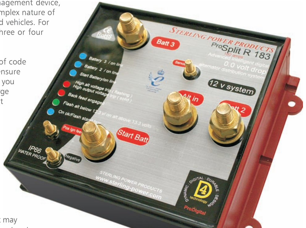
Voltage drop across splitting systems

Unlike conventional Voltage Sensitive Relays (VSR's), ProSplitR has the ability to identify any reverse current or over-voltage condition and disconnect individual batteries to avoid damage or discharge. The ignition sense connection also ensures that the device knows the engine is running and protects the start battery when it is not.